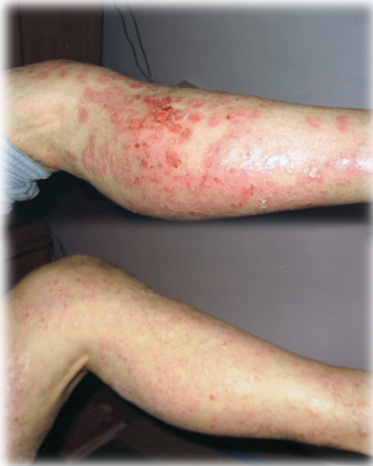
Psoriasis after being on Body Balance for 5 weeks